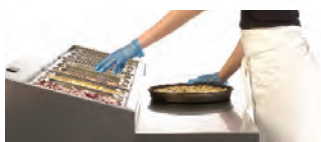
Main image: FPS 3 HR (left) and FPS 2 HR (right) (with optional night cover)