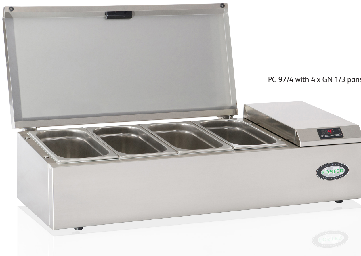
PC 97/4 with 4 x GN 1/3 pans

Foster's Pan Chillers are designed to conveniently turn any work surface into a flexible, refrigerated preparation counter or server. The versatile Pan Chiller range can be wall mounted or free standing, whilst the hinged cover allows for safe storage of ingredients with the flexibility to stay open during preparation, thereby making the ideal solution for assembling pizzas, sandwiches, salads and desserts.