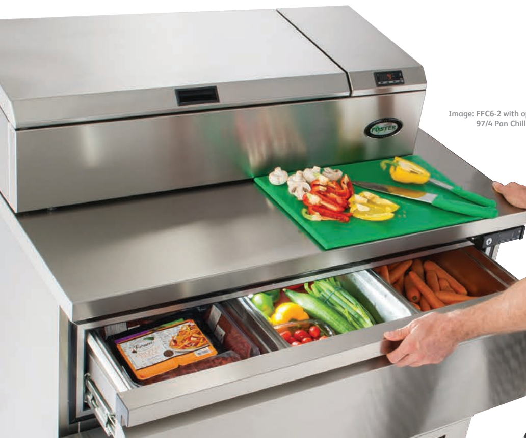
Image: FFC6-2 with optional 97/4 Pan Chiller

Foster FlexDrawer Counters | Design & Aesthetics